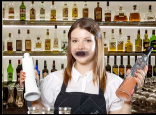
6. Bartender explains why holding Bottle properly is important.