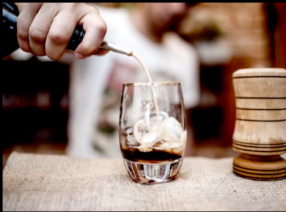
5. ECU of bottle neck and proper gripping technique.