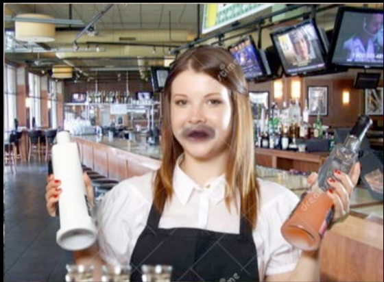
8. Why counting is important.