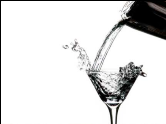
9. ECU on Martini being poured and quality control.