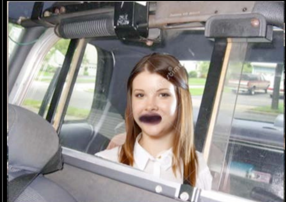
13. Bartender in the back of a Police car, recapping what was learned.