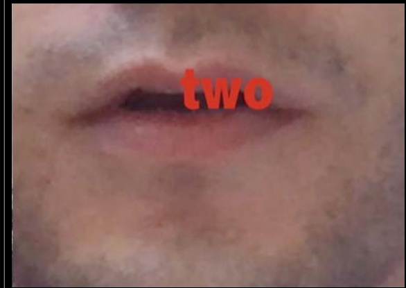
7. ECU on a mouth: "How to count."