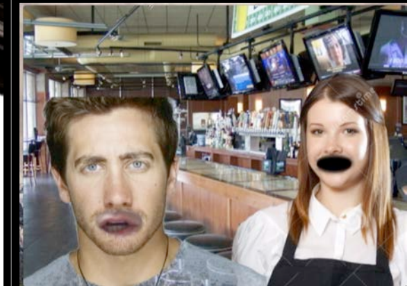
10. Checking a Guest's I.D.