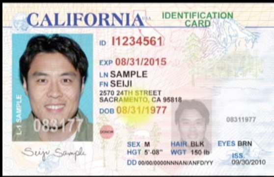
11. ECU on I.D. and what to look for.